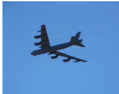
A US B-52 Bomber doing a high pass at the International Airshow this year.

the importance of safety at the field. Our excellent safety record did not happen by accident. Policies have been instrumental in this success. The number of injuries is low but the number of close misses