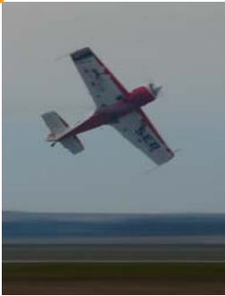
Sukoi on a knife edge pass the the International Airshow this year.